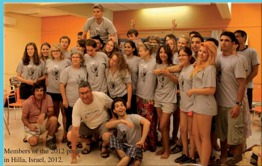
Members of the 2012 project in Hilla, Israel, 2012.