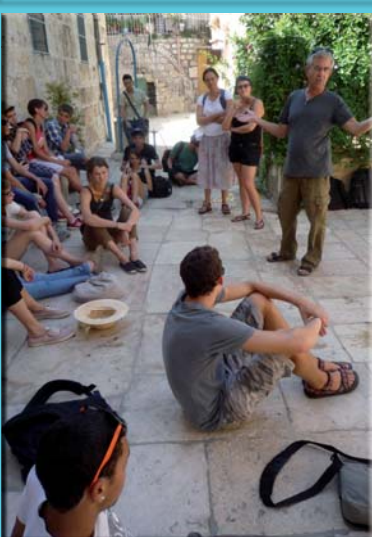
Old city of Jerusalem by day and by night.