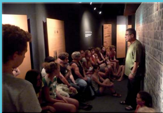
Workshop at the „School of Humanistic Education“ in Beit LeChamei Haetaot.

We want to achieve that the students get a clear idea what racial discrimination at school means in past and in present and what are the possibilities today to fight against it. For this we will deal with the concept and the forms of racial discrimination, as well as with individual stories of eyewitnesses those times and personal experiences of young people.