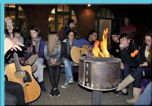
Church of the Holy Sepulchre (left), evening together at the campfire in Magdeburg (above).