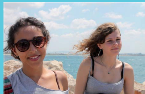
Besides thematic work there is enough time to get to know countryside, its people, and families of project partners as well as excursions to the Dead Sea, in the desert or to the old city of Jerusalem.