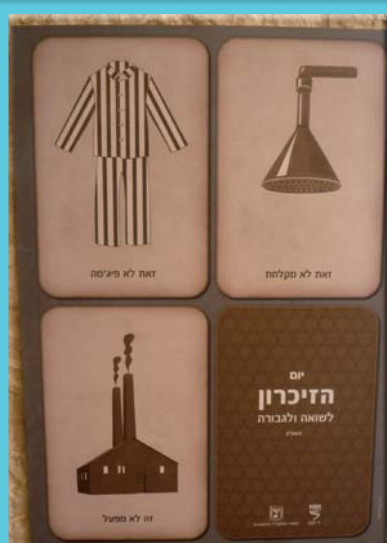
This is no pyjama. this is no shower. This is no factory. Exhibition in Yad Vashem, The Holocaust Martyr's and Heroes' Remembrance Authority, Jerusalem, Israel.